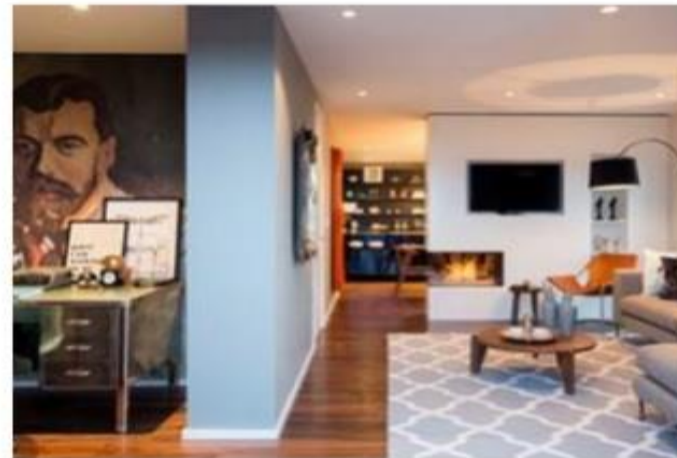
The stylish living space with seamless flow from one room to another.

“I love the richness of the end result, punctuated with random colour splashes so that it feels less show home and more like an actual city home occupied by a discerning and trendy resident.”