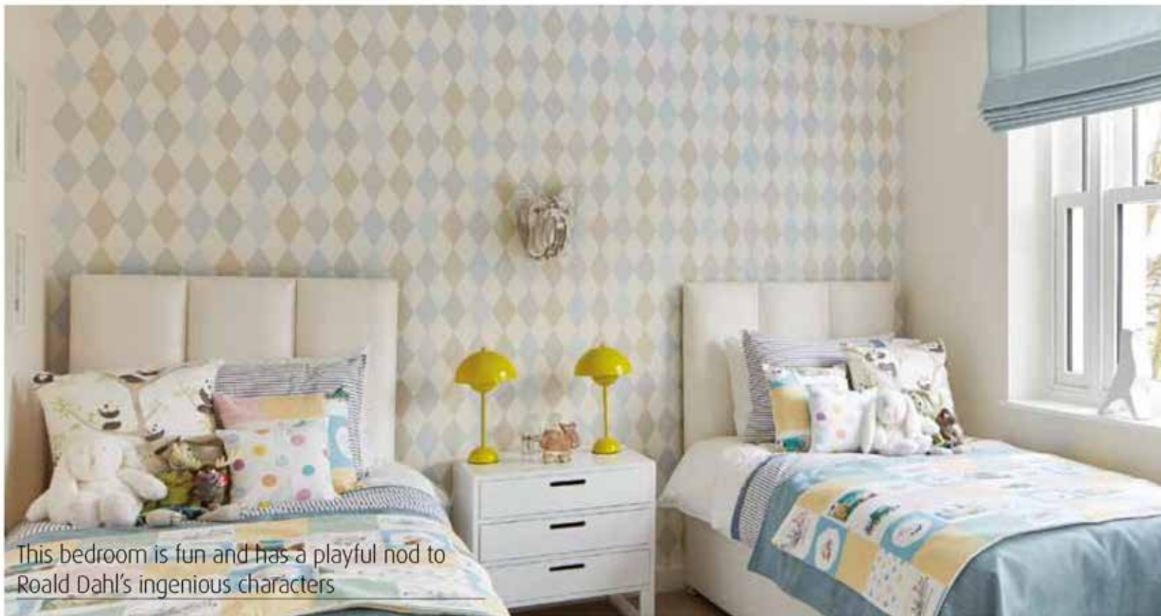
This bedroom is fun and has a playful nod to Roald Dahl's ingenious characters

▲ Eames style rocker with a faux fur throw. An amusing and creative space for any child."