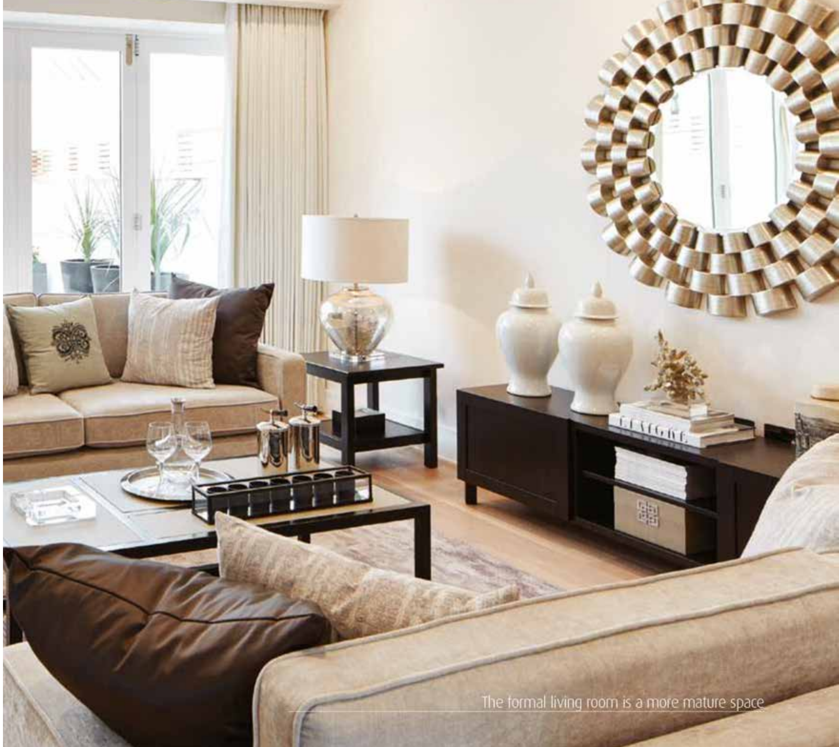
The formal living room is a more mature space