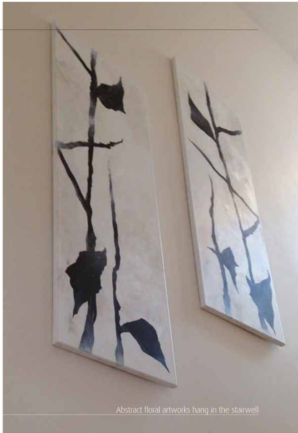
Abstract floral artworks hang in the stairwell

Two large statement, black framed mirrors overlook the dining room which features ▼