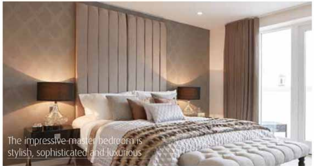
The impressive master bedroom is stylish, sophisticated and luxurious

"The fun Anglepoise bedside lights from French Connection feature a marble base and chrome touches. The chrome is repeated in the studded mirror. Completing the look is the Hans Wegner style shell chair