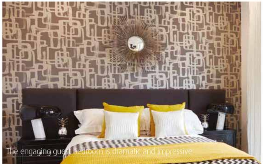
The engaging guest bedroom is dramatic and impressive

in black and walnut and the feature pendant light."