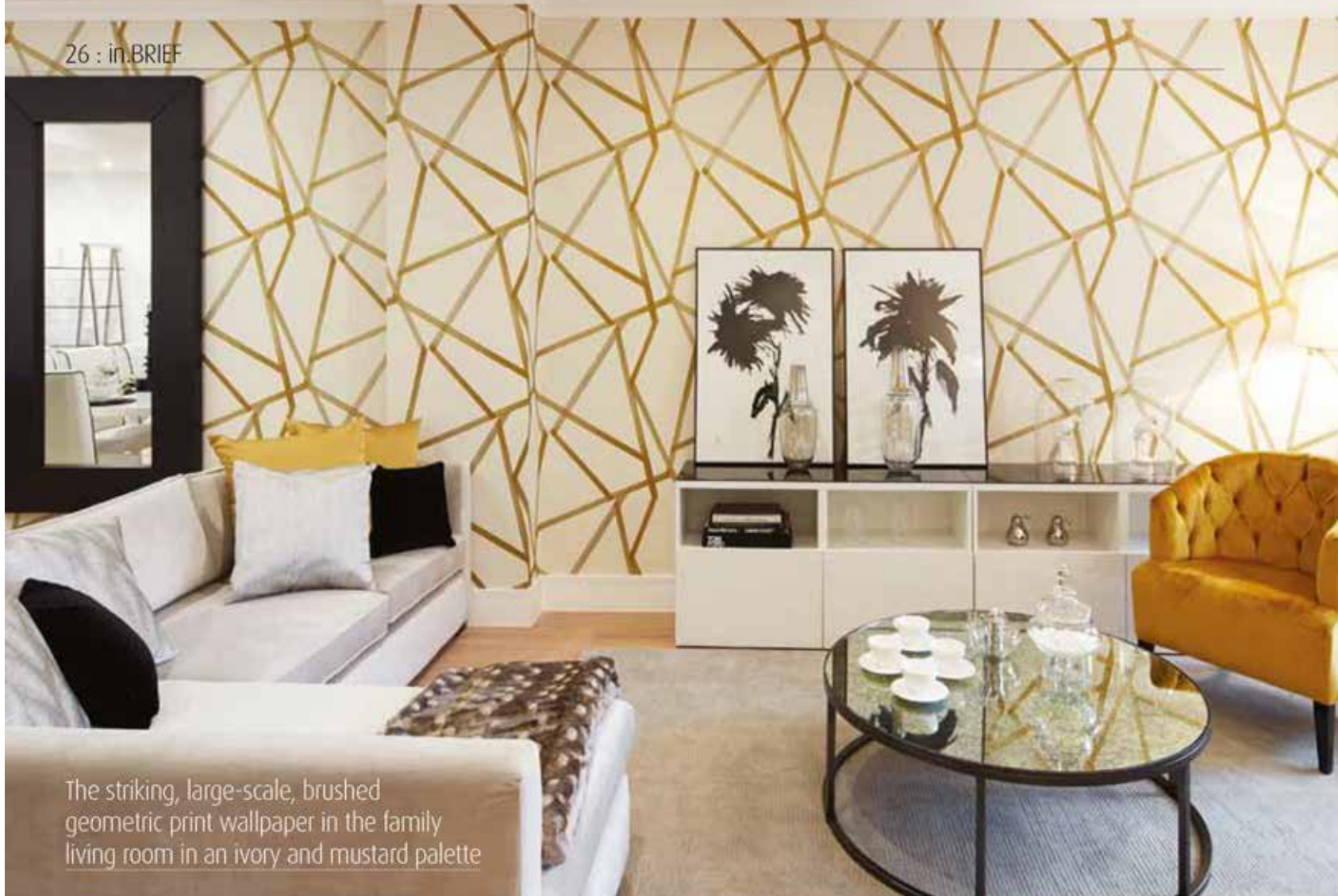
The striking, large-scale, brushed geometric print wallpaper in the family living room in an ivory and mustard palette

▲ a clean black and white palette with touches of mustard in the table napkins. The bespoke white dining chairs with black piping detail sit at the elegant white lacquer table. The table setting is chic and sophisticated in its design. Behind the dining room sits a breakfast bar creating a division between the dining room and kitchen.