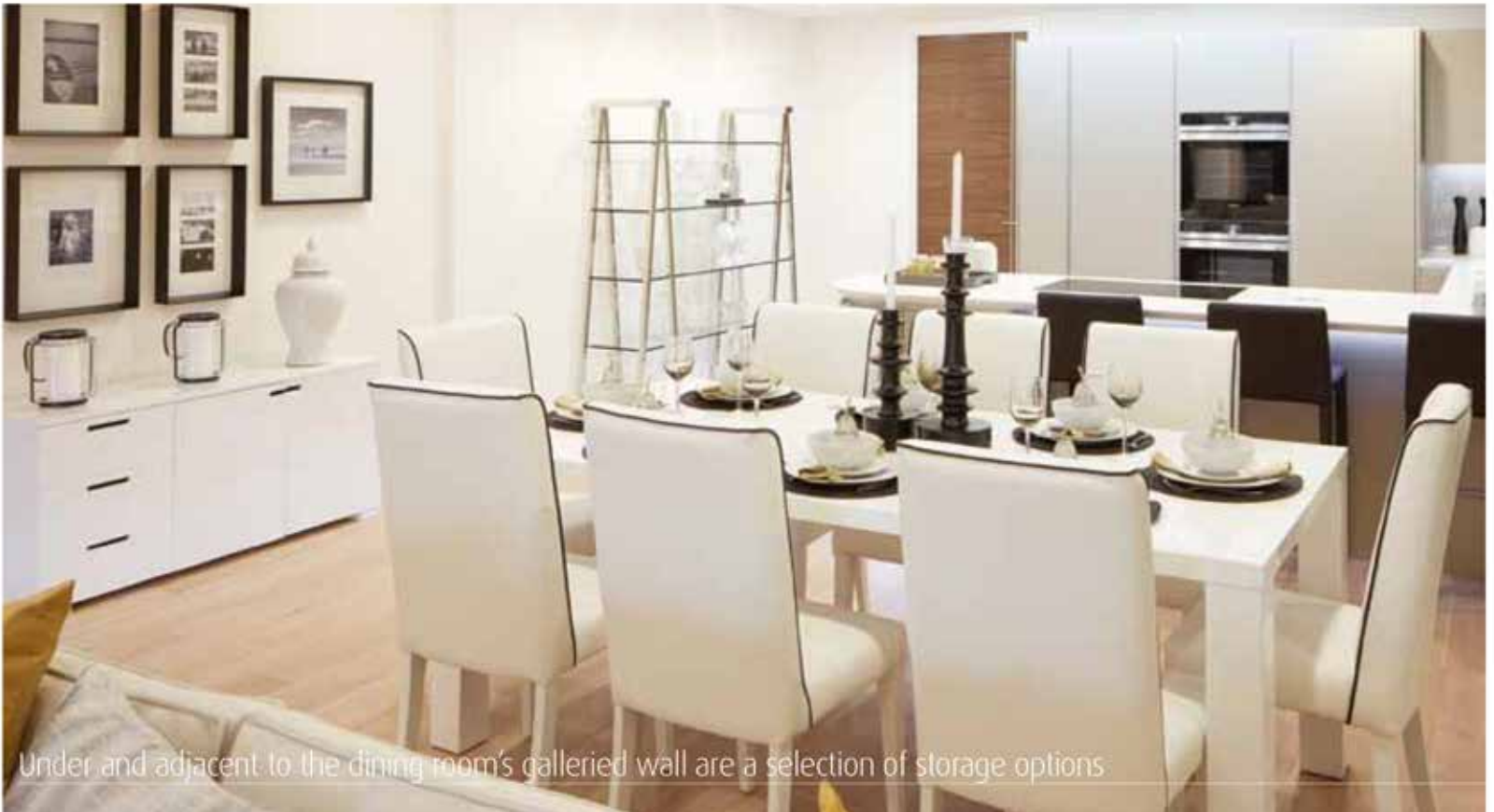
Under and adjacent to the dining room's galleried wall are a selection of storage options

“The team was inspired by the location, the lovely coffee shops, green and leafy Ravenscourt Park and the family-friendly ▼